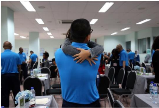
A rare precious date with dad behind bars.

Never write off parents behind bars: They can still bond best with family